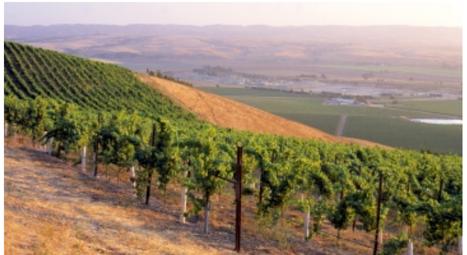
Bien Nacido Vineyard in Santa Barbara County

Likened to Burgundy's Côte d' Or, the east-facing Santa Lucia Highlands lie above the Salinas Valley at 400 feet of elevation. Sleepy Hollow's 29-year-old vines are planted on their own roots in sandy-loam soils. The expected warm, dry conditions are interrupted each afternoon by cool Monterey Bay winds. The long growing season starts earlier and ends later than others in California, allowing grapes to develop a greater range of flavors.